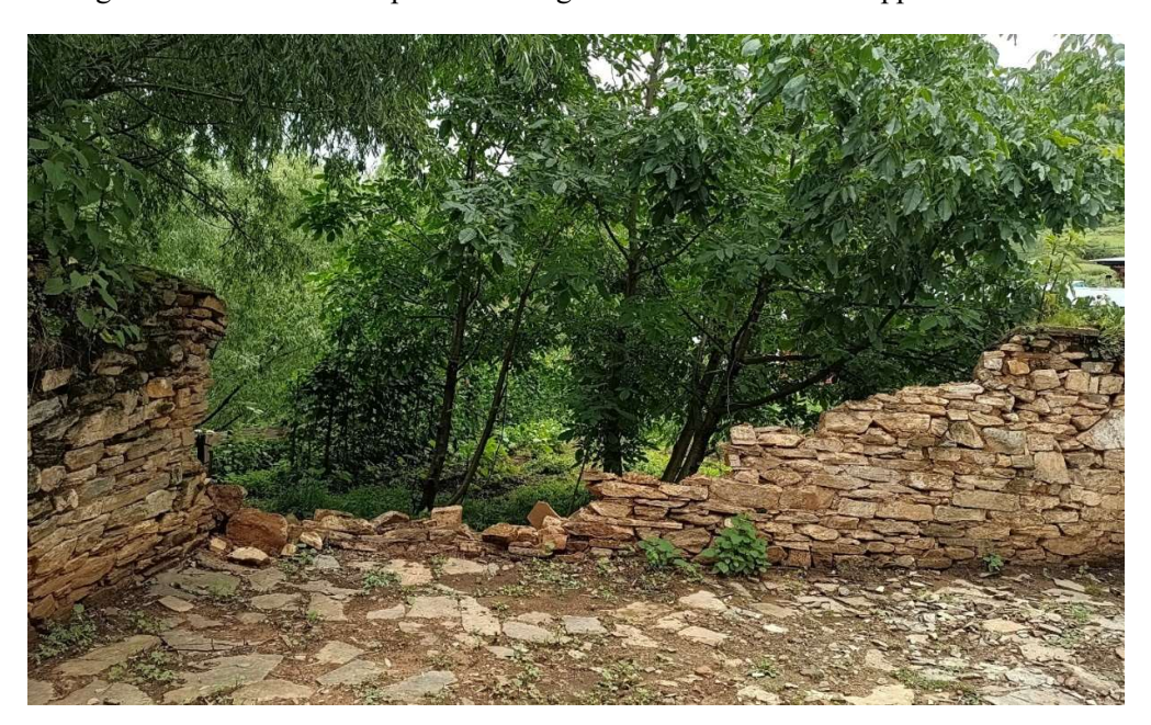
The collapsed wall

Although the aftereffects of the pandemic closure were an ever-present reality, we continued to carry out the necessary works based on our projected plans. We could also respond to some unexpected ad hoc jobs that needed immediate attention. In July after a heavy spate of rain, part of the wall behind the temple collapsed. Sand, cement, and gravel were sourced immediately and brought to site so that the repair could begin as soon as the rain stopped.