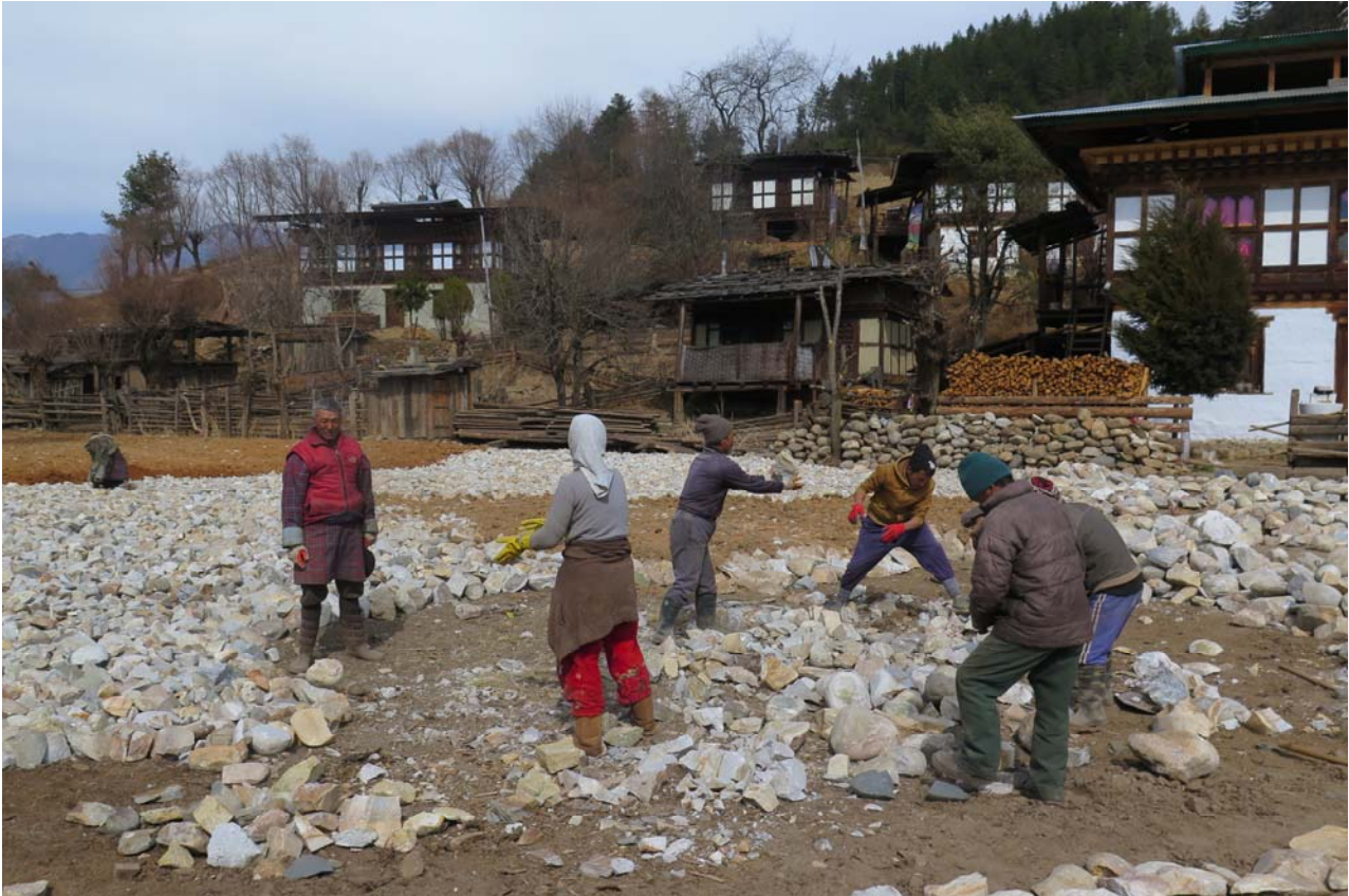
The villagers working on the road

Village improving road: This year Ogyen Choling was fortunate to receive a grant from the gewog development fund of Nu 400,000. Twenty households spent about forty days each working on the road and the “village square”. Although they could not get the roller to work on the road, the condition of the road has greatly improved.