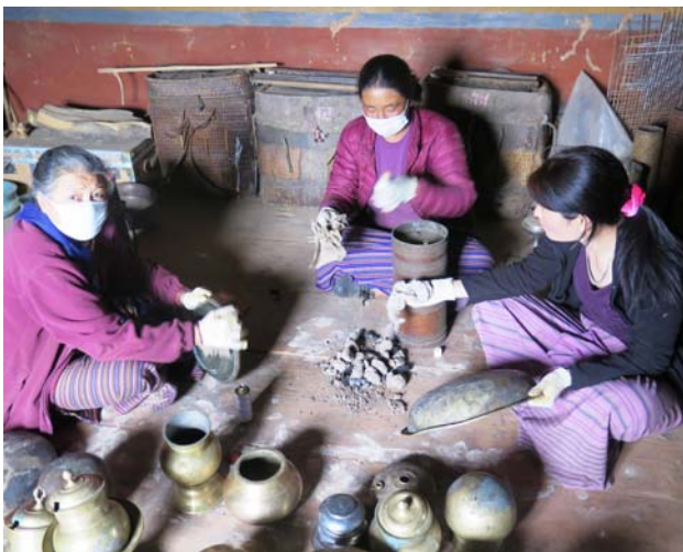
Cleaning artefacts and making inventory

Inventories: Work on various inventories continues.