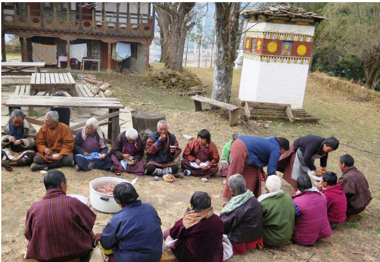
Guests enjoying the Losar lunch

The year of the Female Fire Bird began, as usual, by celebrating losar , the lunar new year, with the community on the 27 th of February. There were around fifty people who participated in the celebration.