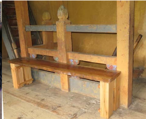
Bench for visitors on the second floor

Visitors to the Museum: The numbers of visitors to the museum both international and Bhutanese has been steady. It is heartening to note that more and more Bhutanese pilgrims include the museum in their pilgrimage itinerary. Once again two groups of international students from