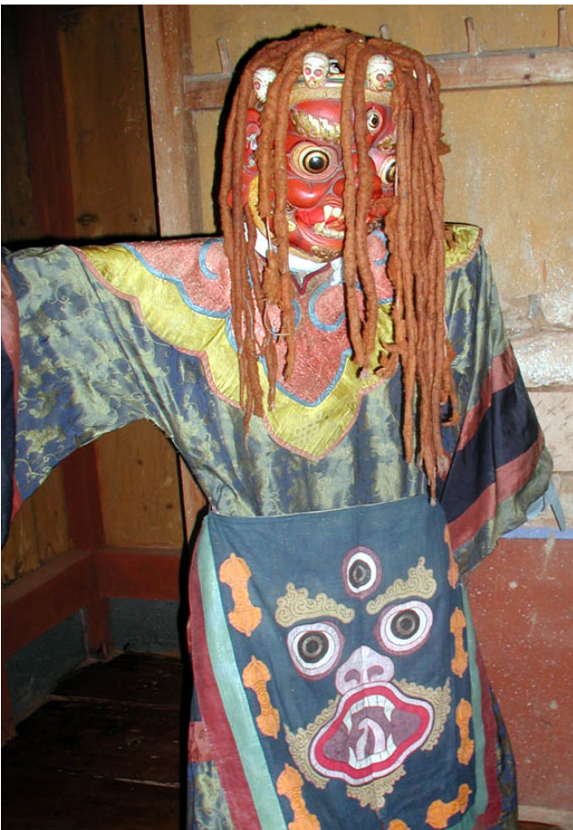
Dance costume and mask

Improvements in all the display rooms have continued. In addition to the existing ten rooms, we have started work on three more rooms. The shortage of skilled carpenters has been a major constraint. But we will continue our policy of employing only local craftsmen. Two rooms on the fourth floor have been prepared for the display of masks, dance costumes and other paraphernalia for mask dances. We are optimistic that both these displays will be ready by the first half of 2003. The masks as well as the costumes are considered by many to be some of the finest specimens in the country. Most of the items are more than 100 years old. The dance tradition was discontinued in Ugyen Choling since about 60 years ago.