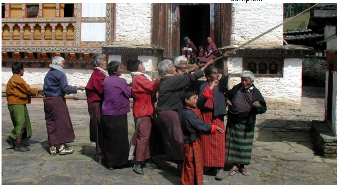
Women pulling the rope to help raise the flag – The spirit of community in Ugyen Choling comes alive during the flag raising ceremony for the Kangso