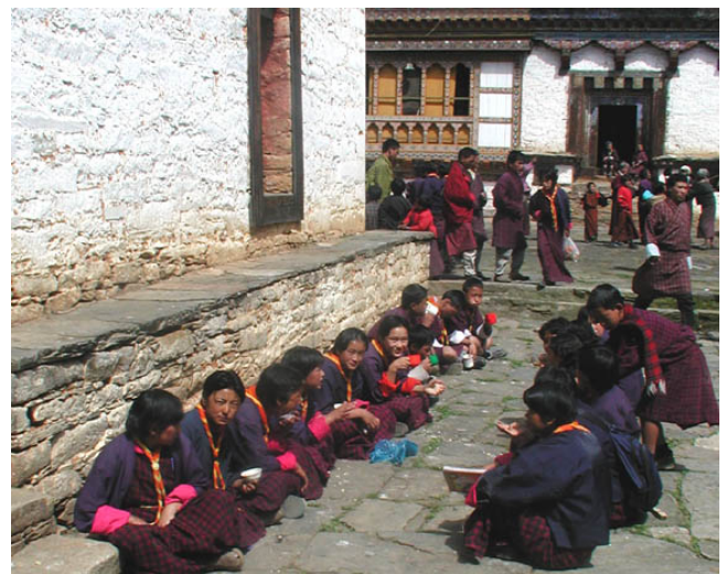
Scouts of the Jakar school being served tea after visiting the museum

During the period covered by the report the museum received 300 international and about 400 Bhutanese visitors.