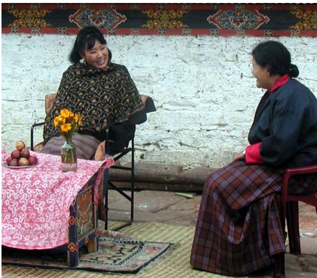
Her Majesty giving audience in front of the temple

In October, Ugyen Choling was honored by the visit of Her Majesty the Queen Ashi Dorji Wangmo Wangchuck. Her Majesty's keen interest in the activities for the preservation of Ugyen Choling, and her gracious words of encouragement "This museum serves as a shining example of how a family has kept the rich heritage alive for future generations to appreciate and learn from." did much to boost our morale and energize us further in our endeavors.