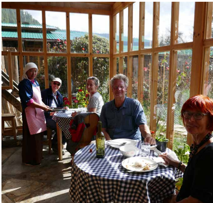
The guests enjoy dining in the winter garden

Thanks to the support by BAFRA (Bhutan Agriculture and Food Regulatory Authority), we could have our water analysed by their laboratory. The test results of samples collected directly from the source and samples of water which was boiled and filtered are both negative for E. coli and Faecal coliform counts, proving that the water is fit for consumption. This is very important for the guest house efforts to eliminate or at least reduce the use of plastic bottles.