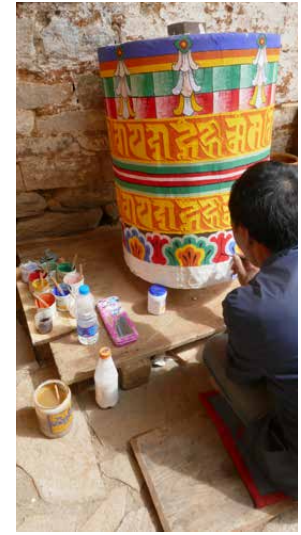
The mani drum repaired and being painted

Chukor mani: The long delayed renovation of the chukor mani (water driven prayer wheel) was completed. The chukor mani which is located at a distance of about two kilometre from the nagtshang had to be dismantled almost completely before the renovation could commence. The Chukor mani was built by the nagtshang family. The repainting has yet to be done and the mani drum, which had to be repaired and repainted, has yet to be placed in the structure. As some of the water for turning the wheel has been diverted for paddy irrigation in the valley we have to improvise ways to get the prayer wheel moving with the remaining water.