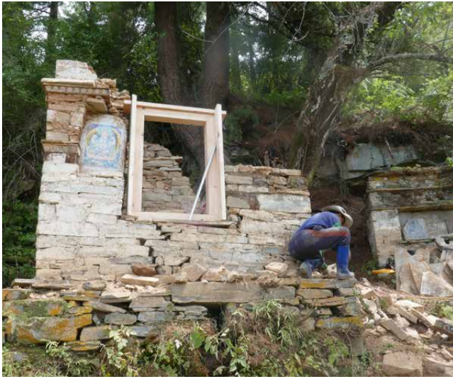
Dismantling the damaged wall of the Chukor mani