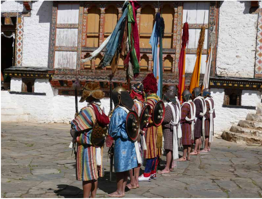
In the time honored tradition the soldiers in medieval costumes prepare for the sword dance

same dates as the Kangsoe. That, however, proved not to be a problem, all the usual attendees and even more people came for the flag hoisting ceremony and prayers. Unfortunately, as all of the school children (the future generation) from the village were engaged in the prayers, they could not participate in the procession. Their participation is important for the continuity of the Kangsoe procession. Even as we endeavour to uphold the old customs and traditions, we have to accept changes that are beyond our control.