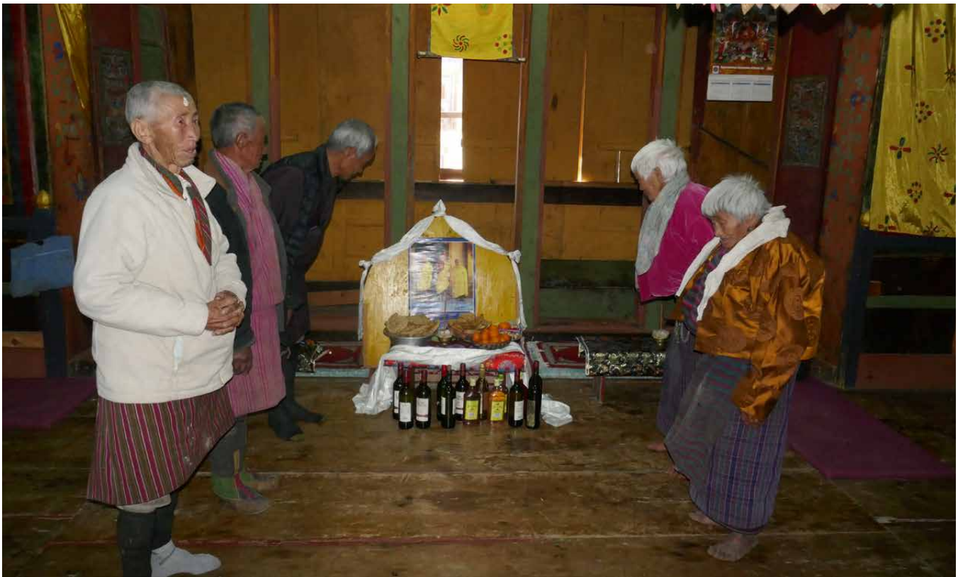
Elders from the village with the offerings in the temple on Losar

As we look back on the year of the Pig we are filled with gratitude and a sense of satisfaction for we were able to achieve most of what we hoped to do. As should have been expected, the Pig repeatedly reminded us of its presence by constant intrusions into the compound of the foundation and the crop fields of the farmers in the valley.