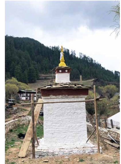
(top left) The badly damaged chorten (top right) The chorten dismantled to the base (bottom left) The old shokshing from the chorten (bottom middle) new shokshing redressed with offerings (bottom right) the final touch ups of the chorten